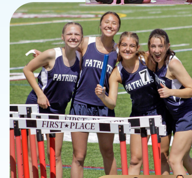
Girls Track and Field