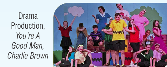
Drama Production, You're A Good Man, Charlie Brown

Business sponsorship directly supports academics, athletics and the arts. It's in these areas where students learn the value of sportsmanship, community service, and leadership. Bangor Christian Schools is committed to excellence in education.